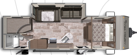
ASPEN TRAIL LE 28BHWE Length: 33' 3" Weight: 6,418 lbs Sleeps: 4-6