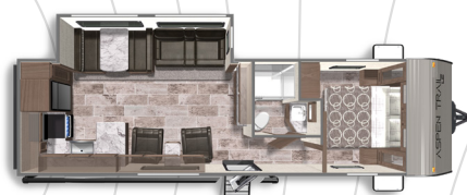
ASPEN TRAIL LE 28RKWE Length: 33' 3" Weight: 6,604 lbs Sleeps: 4-6