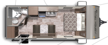
ASPEN TRAIL LE 19RBWE Length: 24' 8" Weight: 4,283 lbs Sleeps: 2-4