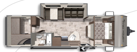
ASPEN TRAIL LE 29BHWE Length: 33' 3" Weight: 6,561 lbs Sleeps: 4-6