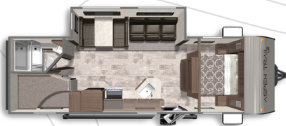
ASPEN TRAIL LE 26BHWE Length: 30' 9" Weight: 6,115 lbs Sleeps: 4-6