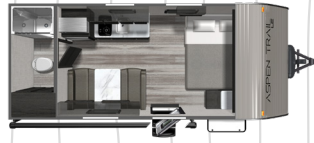
ASPEN TRAIL MINI 17RB Length: 21' 5" Weight: TBD Sleeps: 2-4