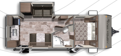
ASPEN TRAIL LE 23RKSWE Length: 27' 4" Weight: 5,600 lbs Sleeps: 4-6