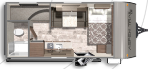
ASPEN TRAIL MINI 17BH Length: 21' 5" Weight: 3,069 lbs Sleeps: 2-4