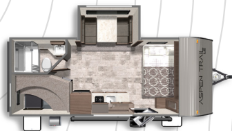
ASPEN TRAIL MINI 1980BH Length: 23' 5" Weight: 4,325 lbs Sleeps: 2-4