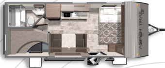
ASPEN TRAIL MINI 1950BH Length: 22' 10" Weight: 3,676 lbs Sleeps: 2-4