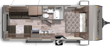
ASPEN TRAIL LE 21RDWE Length: 25' 5" Weight: 4,407 lbs Sleeps: 4-6