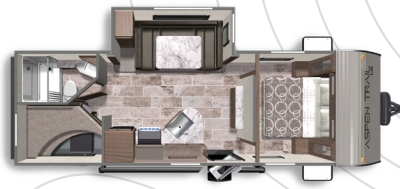
ASPEN TRAIL LE 23BHSWE Length: 27' 8" Weight: 5,613 lbs Sleeps: 4-6