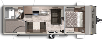
ASPEN TRAIL LE 24BHWE Length: 28' 8" Weight: 4,875 lbs Sleeps: 4-6