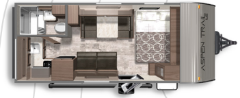
ASPEN TRAIL MINI 1860RK Length: 21' 5" Weight: 3,577 lbs Sleeps: 2-4