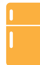
10 cu. ft 12v Refrigerator

*Our weights represent how most units are build, inclusive of many commonly ordered options.