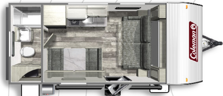
COLEMAN LANTERN LT 17RB Length: 21' 6" Weight: 3,588 lbs Sleeps: 3-4