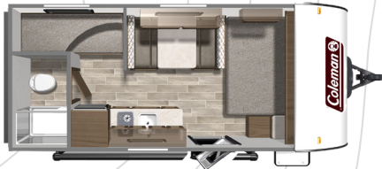
COLEMAN LANTERN LT 17B* Length: 21' 5" Weight: 3,078 lbs Sleeps: 4-6