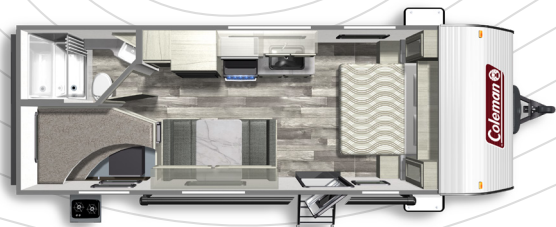
COLEMAN LANTERN LT 214BH Length: 25' 11" Weight: 4,542 lbs Sleeps: 4-6