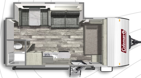
COLEMAN LANTERN LT 18FQ Length: 22' 9" Weight: 4,110 lbs Sleeps: 2-4