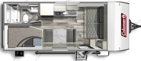
COLEMAN LANTERN LT 18BH Length: 22' 10" Weight: 3,587 lbs Sleeps: 3-4