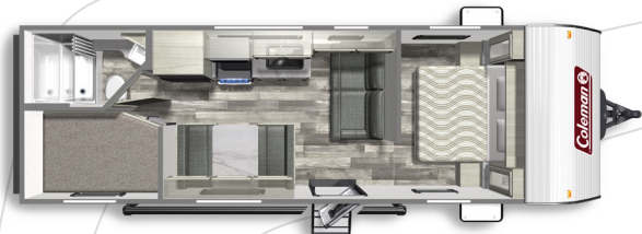
COLEMAN LANTERN LT 274BH Length: 28' 6" Weight: 4,824 lbs Sleeps: 4-8